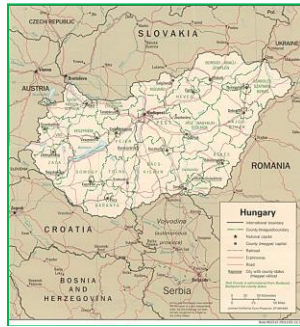
Map source: Political map of Hungary (1994), retrieved from maps.lib.utexas.edu/maps/Europe/hungary.jpg

Topographic maps. The below example is a shaded relief map of Eastern Europe: